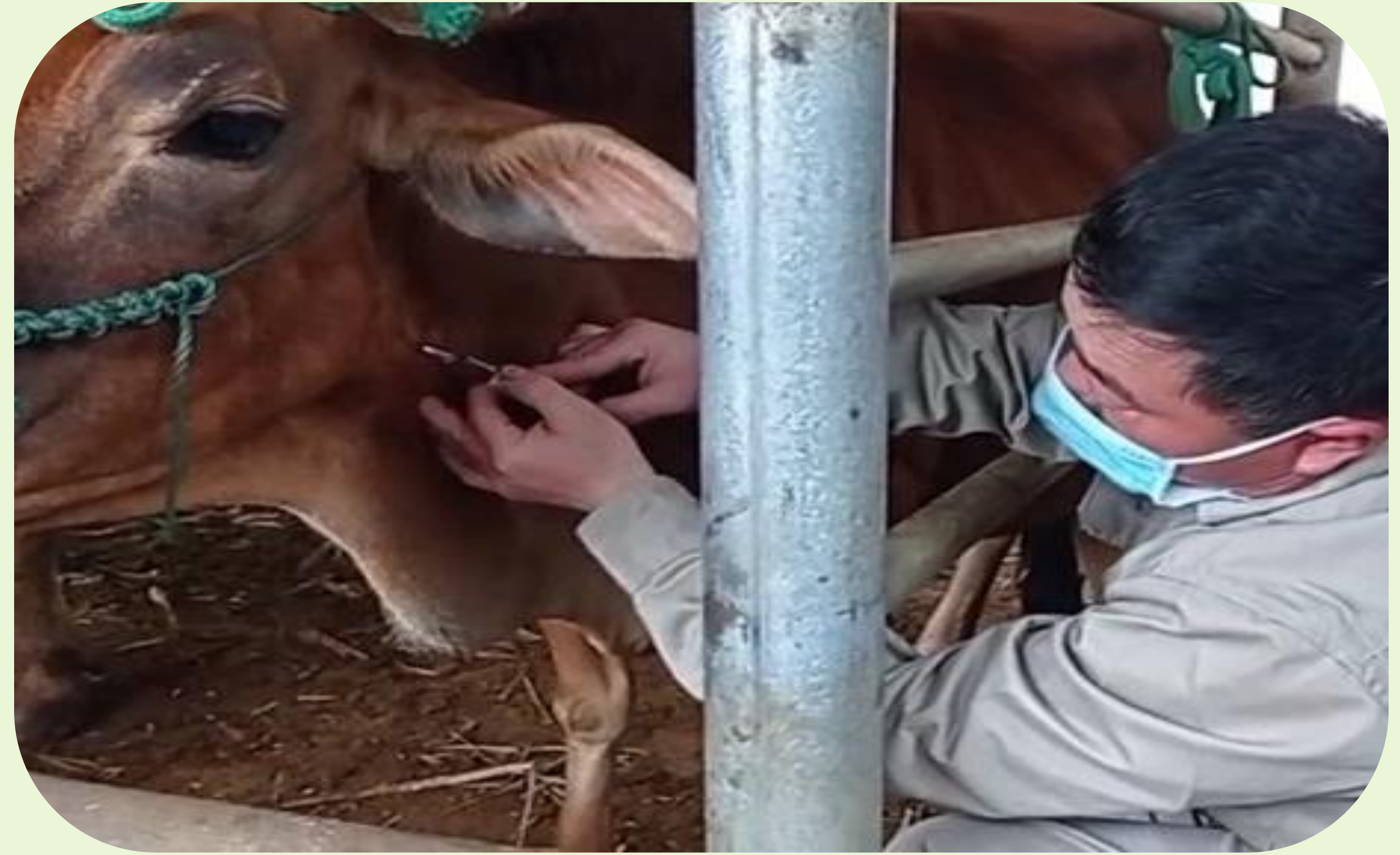
Local veterinarian practices injection and blood sampling in cattle during the training

Pigs and cattle are an important source of income for smallholder farmers in the northwest highlands of Vietnam, whereas most small-scale livestock farmers still rely on traditional husbandry practices, lacking the necessary knowledge of livestock management, biosecurity and veterinary services. The integrated approach to improve livestock productivity such as feed and forages, animal breeding, and markets, especially animal health are important for small- and medium farms to sustain their farming activities. The SAPLING and SAAF under CGIAR initiatives have been implementing bundled intervention packages to tackle those challenges.